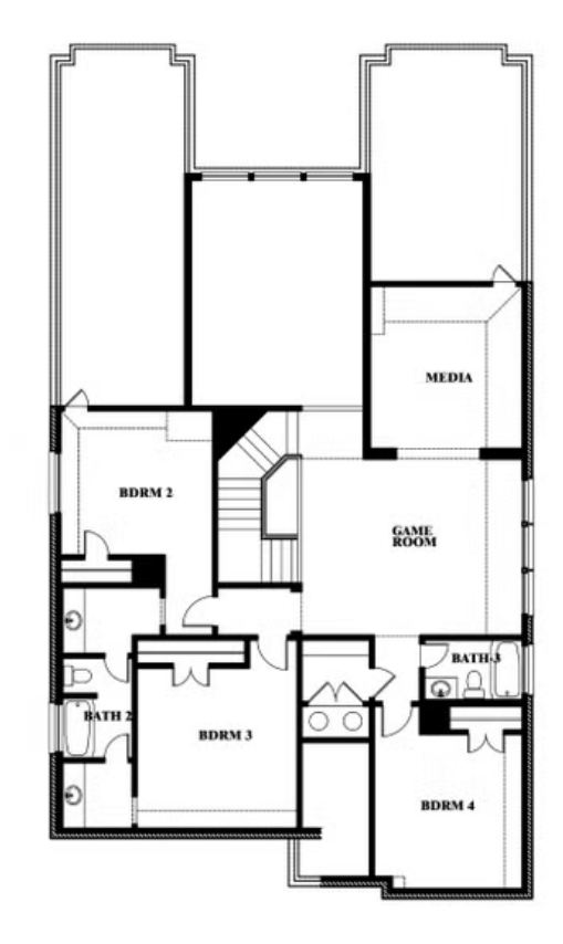
Rose II Opt. Bed & Bath at Study

This brochure is for general informational purposes and is to be used as a guide only. Changes may be made during the development process and floorplans, dimensions, fixtures, fittings, finishes and specifications are subject to change without notice. Window placement, balcony configuration, wardrobe sizes and living areas may vary slightly within each plan type. EQUAL HOUSING OPPORTUNITY