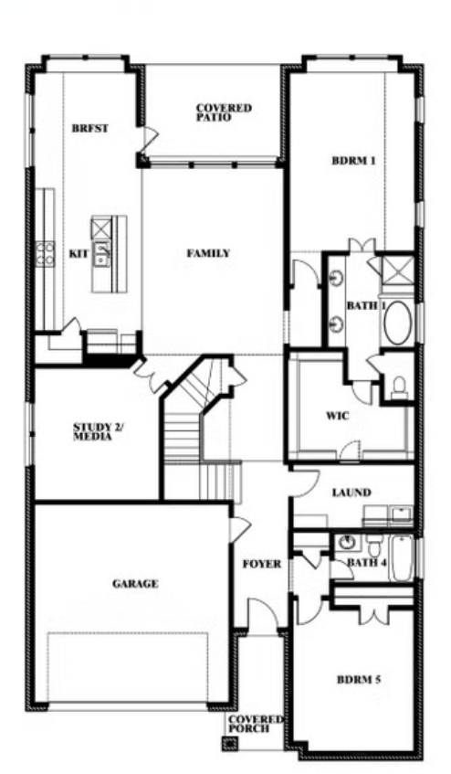
Rose Opt. Bed & Bath at Study