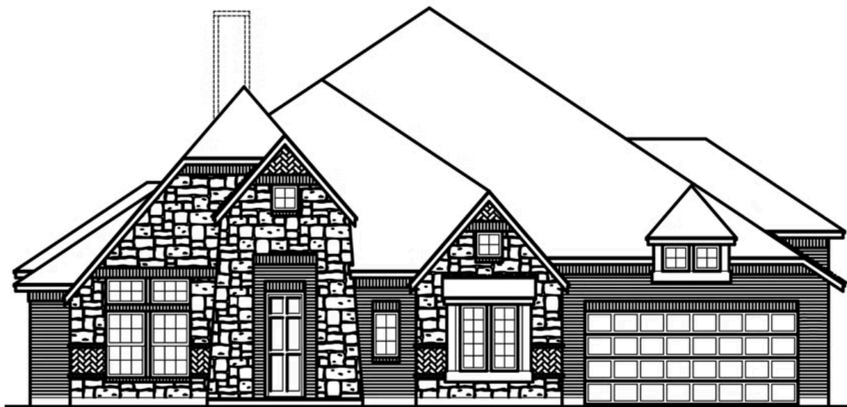
DAFFODIL ELEVATION B