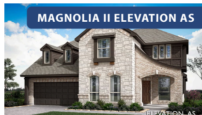
MAGNOLIA II ELEVATION AS