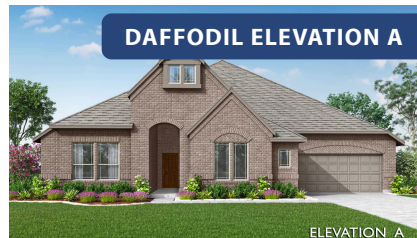
DAFFODIL ELEVATION A