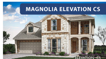
MAGNOLIA ELEVATION CS