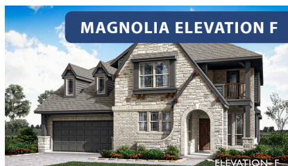
MAGNOLIA ELEVATION F