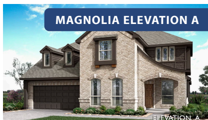
MAGNOLIA ELEVATION A