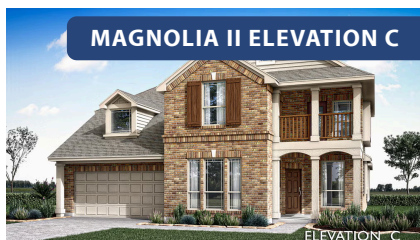
MAGNOLIA II ELEVATION C