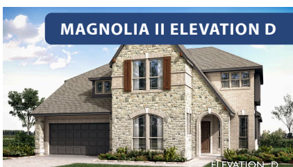
MAGNOLIA II ELEVATION D