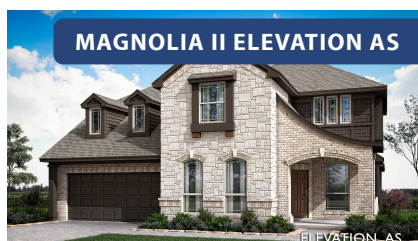
MAGNOLIA II ELEVATION AS