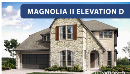
MAGNOLIA II ELEVATION D