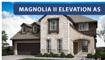
MAGNOLIA II ELEVATION AS