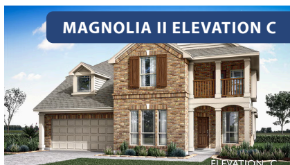
MAGNOLIA II ELEVATION C