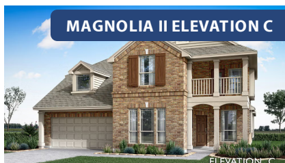
MAGNOLIA II ELEVATION C