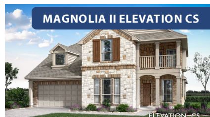
MAGNOLIA II ELEVATION CS