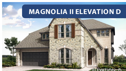
MAGNOLIA II ELEVATION D