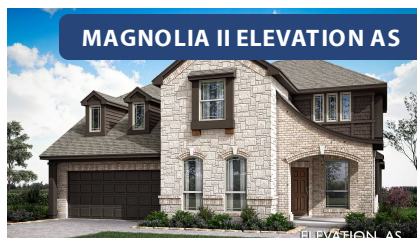
MAGNOLIA II ELEVATION AS