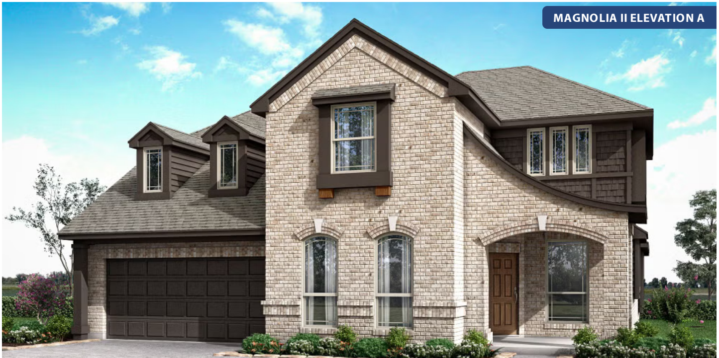
MAGNOLIA II ELEVATION A