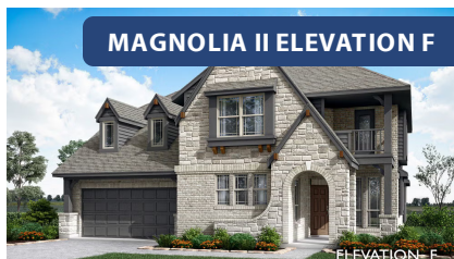
MAGNOLIA II ELEVATION F