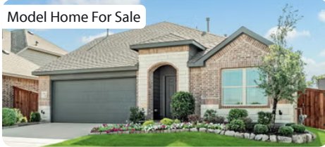
Model Home For Sale