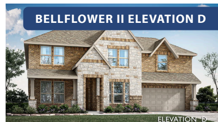
BELLFLOWER II ELEVATION D