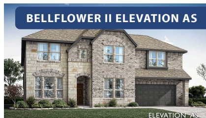
BELLFLOWER II ELEVATION A