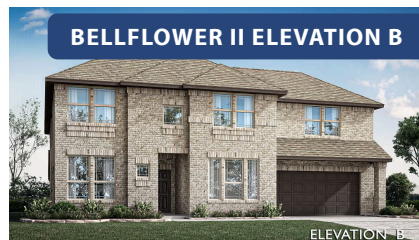
BELLFLOWER II ELEVATION B