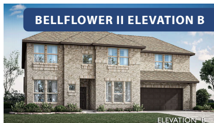
BELLFLOWER II ELEVATION B