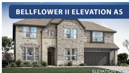
BELLFLOWER II ELEVATION AS