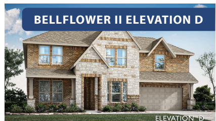
BELLFLOWER II ELEVATION D