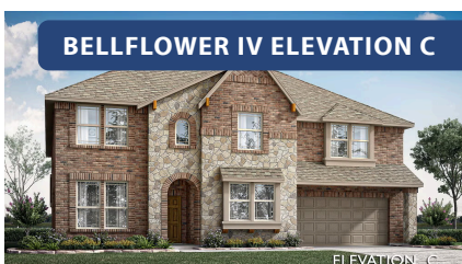
BELLFLOWER IV ELEVATION C