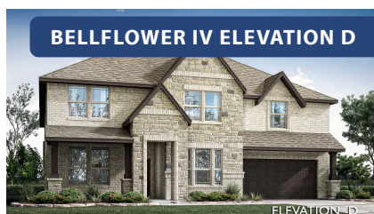
BELLFLOWER IV ELEVATION D