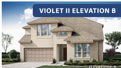
VIOLET II ELEVATION B