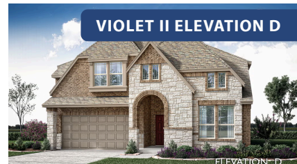
VIOLET II ELEVATION D