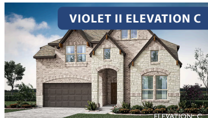
VIOLET II ELEVATION C