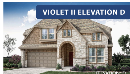
VIOLET II ELEVATION D