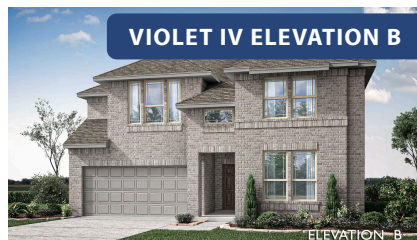
VIOLET IV ELEVATION B