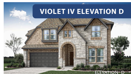
VIOLET IV ELEVATION D