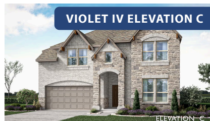
VIOLET IV ELEVATION C