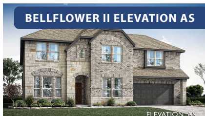
BELLFLOWER II ELEVATION AS