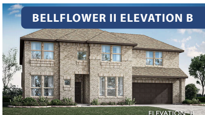
BELLFLOWER II ELEVATION B