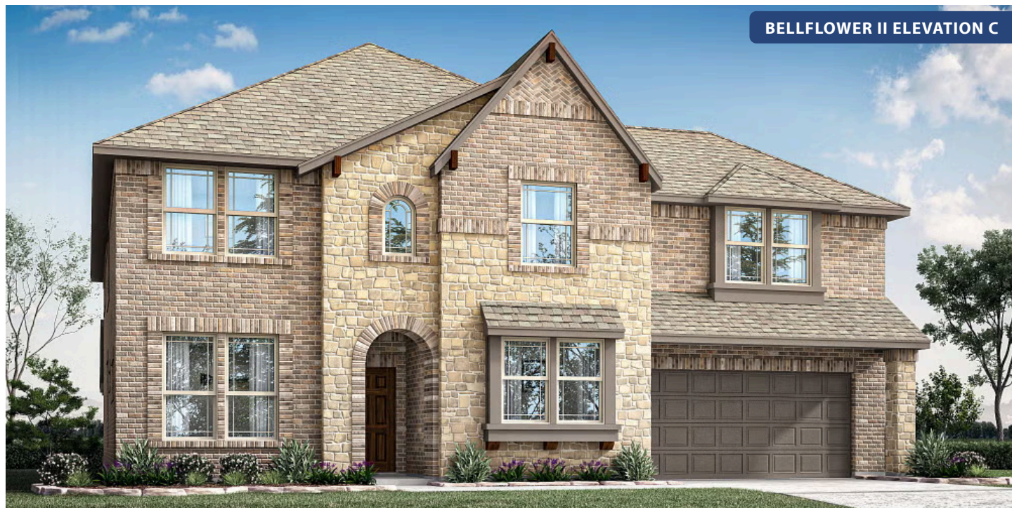
BELLFLOWER II ELEVATION C