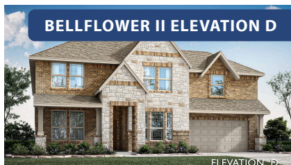
BELLFLOWER II ELEVATION D