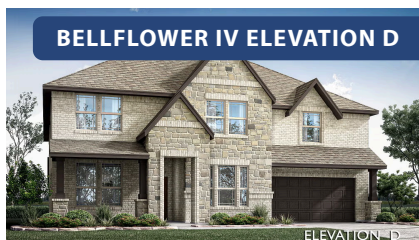
BELLFLOWER IV ELEVATION D