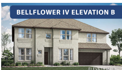
BELLFLOWER IV ELEVATION B