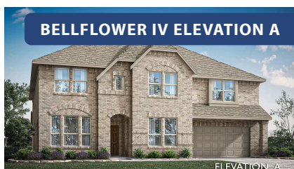
BELLFLOWER IV ELEVATION A