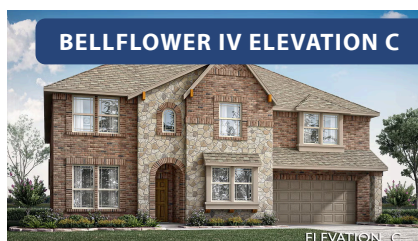
BELLFLOWER IV ELEVATION C