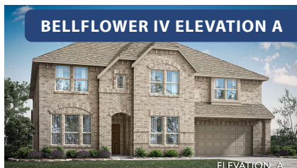
BELLFLOWER IV ELEVATION A