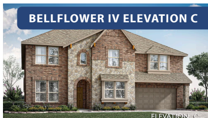
BELLFLOWER IV ELEVATION C