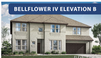
BELLFLOWER IV ELEVATION B