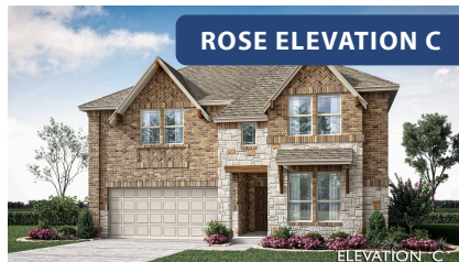
ROSE ELEVATION C