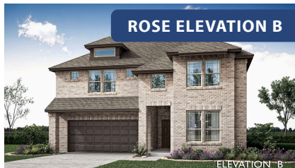
ROSE ELEVATION B