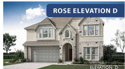
ROSE ELEVATION D