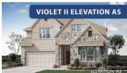
VIOLET II ELEVATION AS