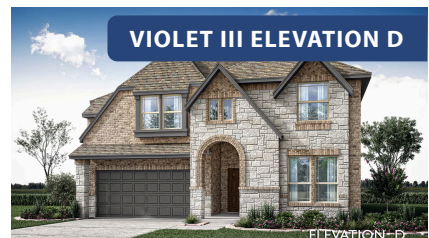
VIOLET III ELEVATION D