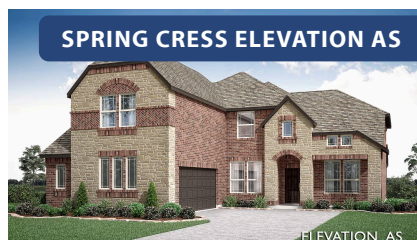
SPRING CRESS ELEVATION AS