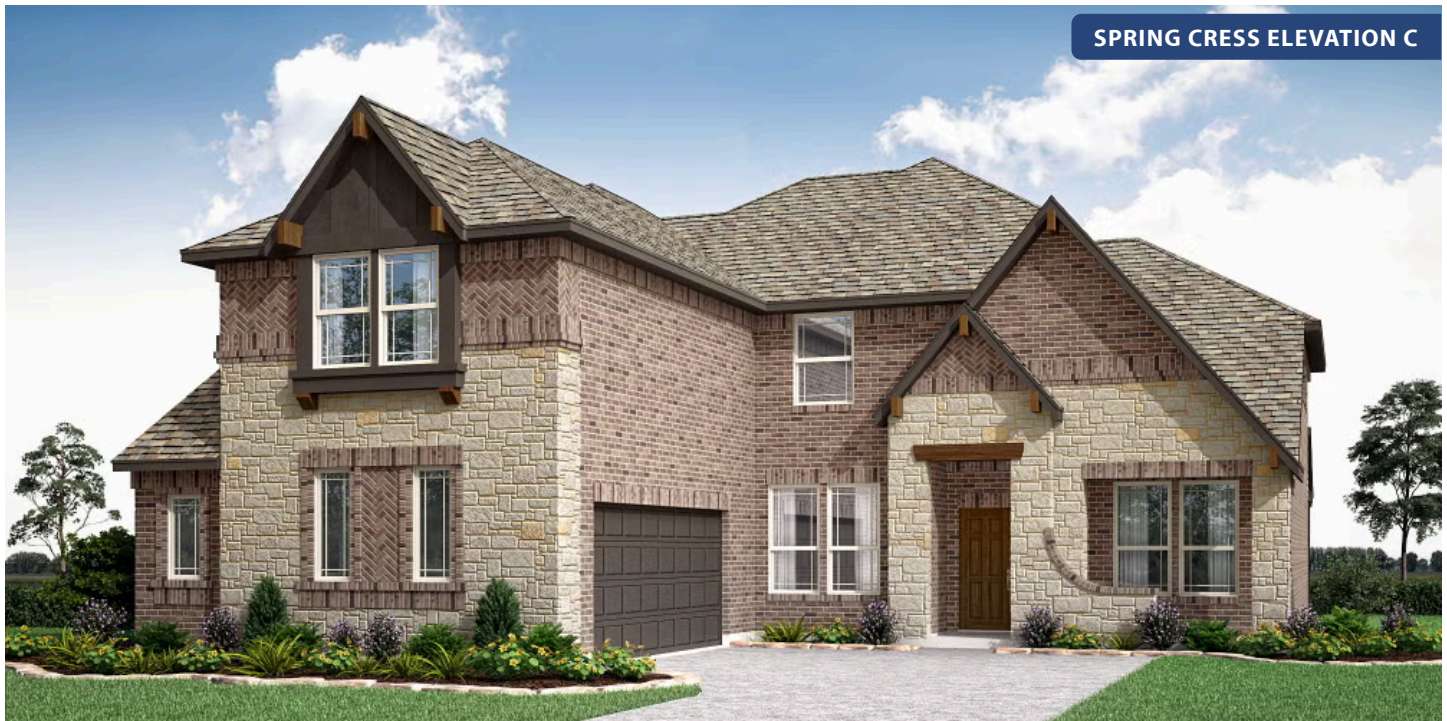
SPRING CRESS ELEVATION C