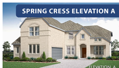
SPRING CRESS ELEVATION A