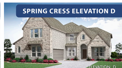
SPRING CRESS ELEVATION D