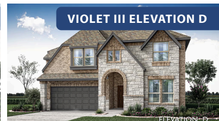
VIOLET III ELEVATION D