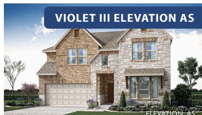
VIOLET III ELEVATION AS