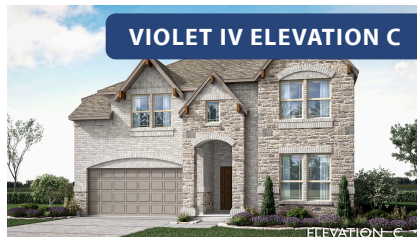
VIOLET IV ELEVATION C