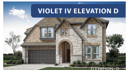
VIOLET IV ELEVATION D