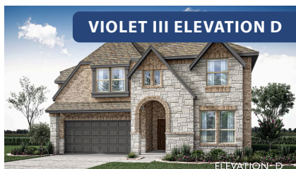
VIOLET III ELEVATION D