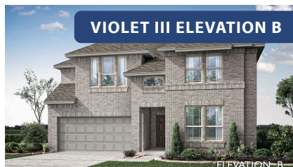
VIOLET III ELEVATION B