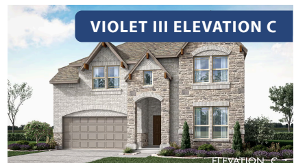
VIOLET III ELEVATION C