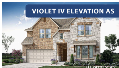
VIOLET IV ELEVATION AS