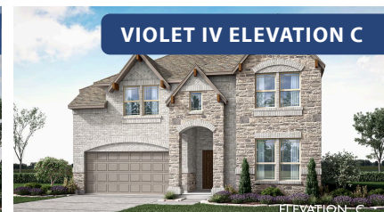
VIOLET IV ELEVATION C