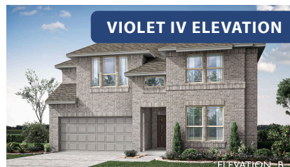
VIOLET IV ELEVATION B