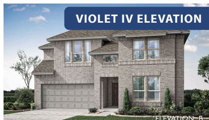
VIOLET IV ELEVATION