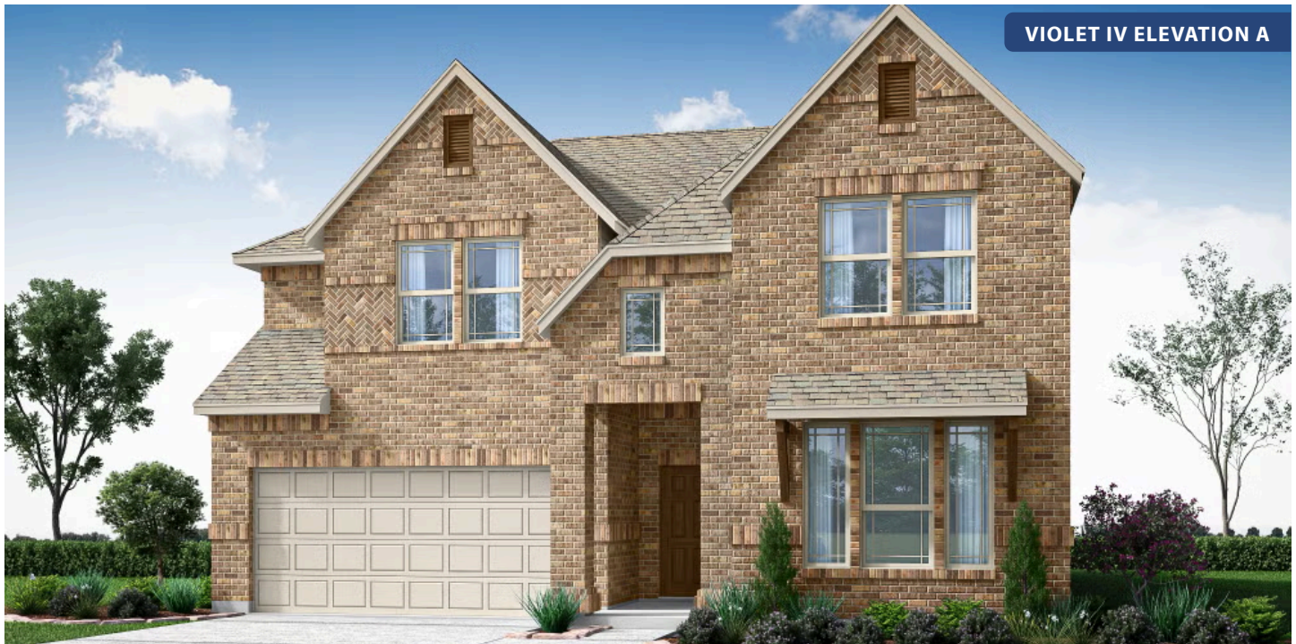
VIOLET IV ELEVATION A