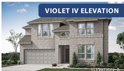
VIOLET IV ELEVATION