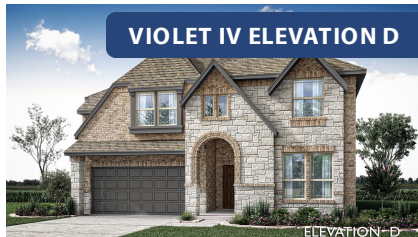
VIOLET IV ELEVATION D