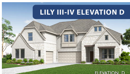
LILY III-IV ELEVATION D