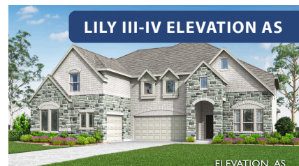
LILY III-IV ELEVATION AS