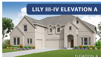
LILY III-IV ELEVATION A