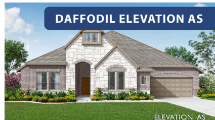
DAFFODIL ELEVATION AS