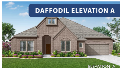
DAFFODIL ELEVATION A