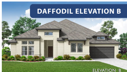
DAFFODIL ELEVATION B