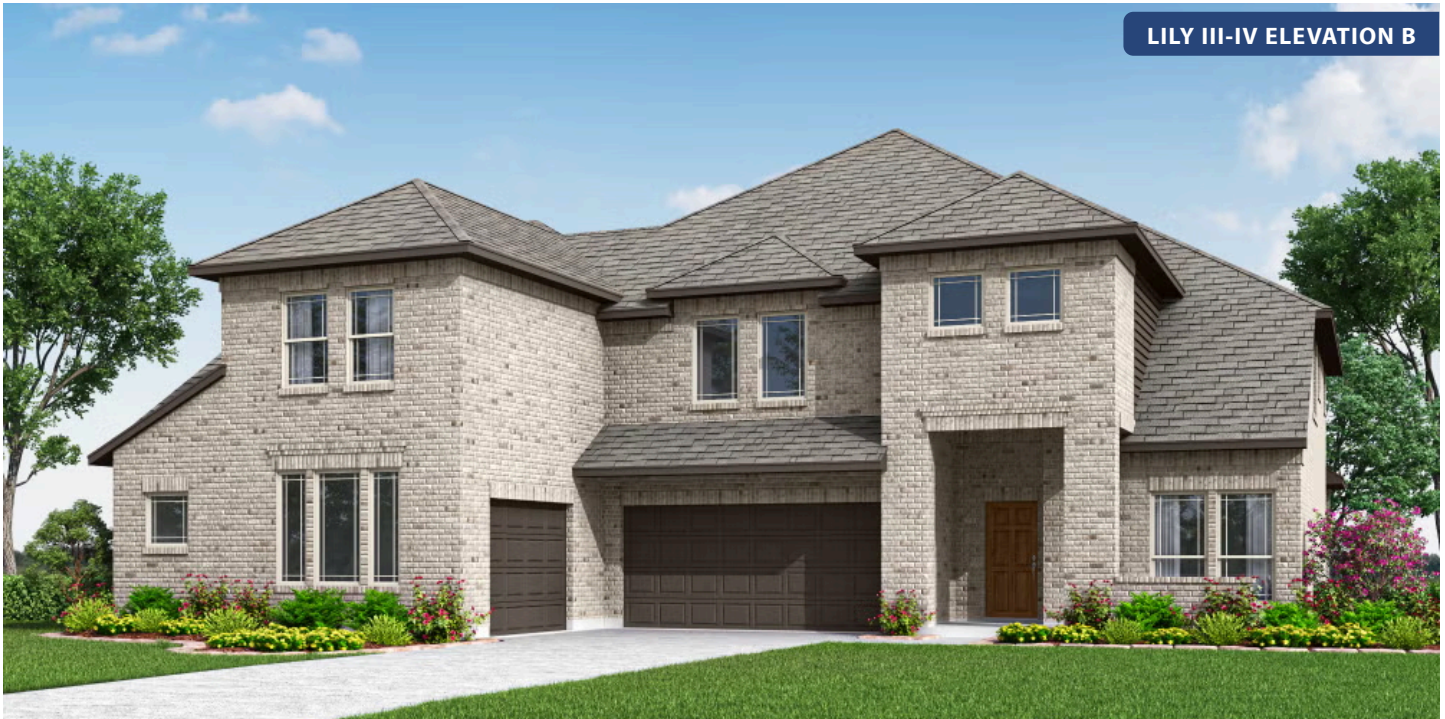
LILY III-IV ELEVATION B