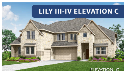
LILY III-IV ELEVATION C