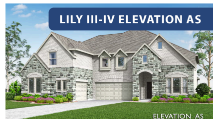
LILY III-IV ELEVATION AS