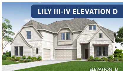
LILY III-IV ELEVATION D