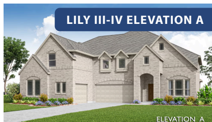
LILY III-IV ELEVATION A