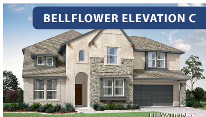
BELLFLOWER ELEVATION C