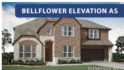
BELLFLOWER ELEVATION AS