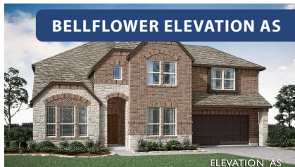
BELLFLOWER ELEVATION AS