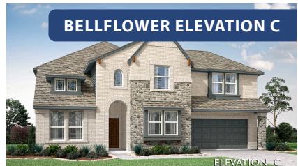
BELLFLOWER ELEVATION C