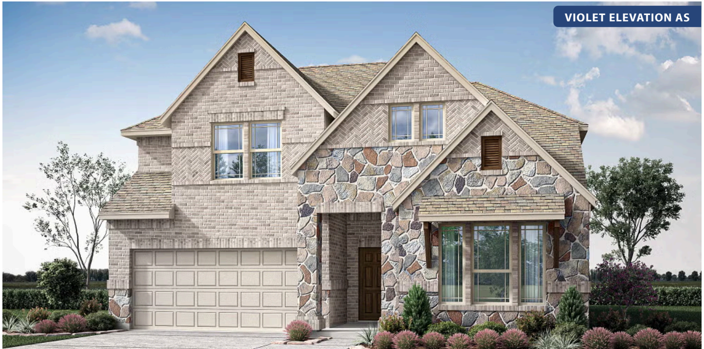
VIOLET ELEVATION AS