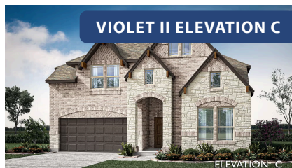
VIOLET II ELEVATION C