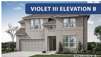
VIOLET III ELEVATION B