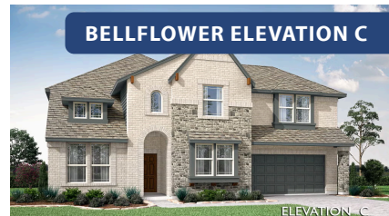
BELLFLOWER ELEVATION C