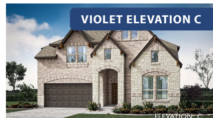
VIOLET ELEVATION C