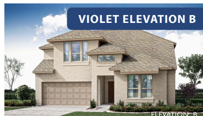
VIOLET ELEVATION B