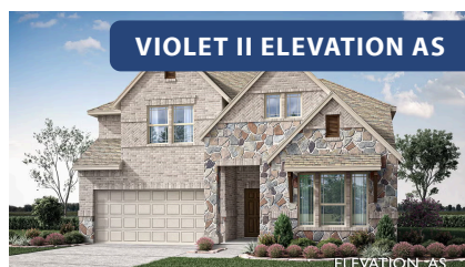
VIOLET II ELEVATION AS