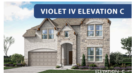
VIOLET IV ELEVATION C