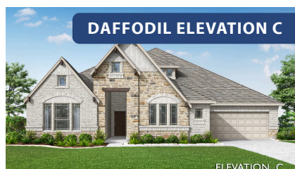
DAFFODIL ELEVATION C