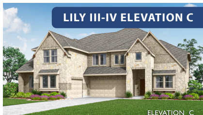
LILY III-IV ELEVATION C