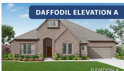
DAFFODIL ELEVATION A