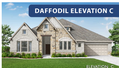
DAFFODIL ELEVATION C