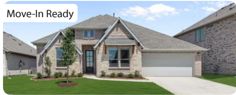
1148 Hitching Post Way OAK POINT, TX 75068 CARAWAY FLOOR PLAN

2,527 SQUARE FEET 4 BEDS 3 BATHS 2 GARAGE 1 STORY WAS $579,292 NOW $518,000