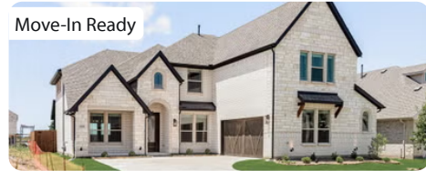
1133 Hitching Post Way OAK POINT, TX 75068 SPRING CRESS II FLOOR PLAN

3,560 SQUARE FEET 5 BEDS 4 BATHS 3 GARAGE 2 STORIES WAS $661,493 NOW $577,000