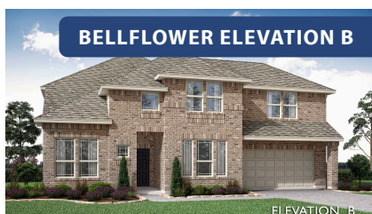
BELLFLOWER ELEVATION B