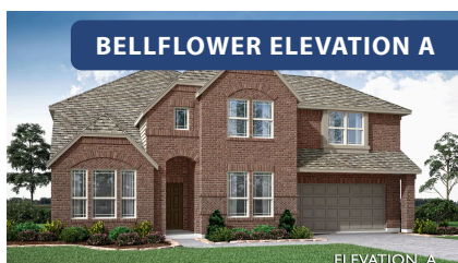
BELLFLOWER ELEVATION A