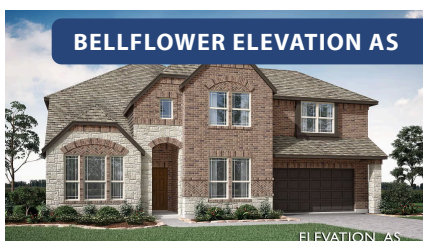
BELLFLOWER ELEVATION AS