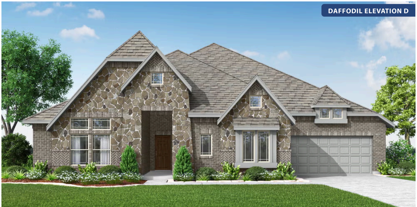
DAFFODIL ELEVATION D