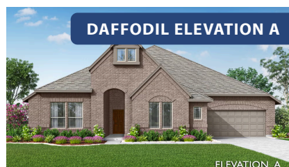
DAFFODIL ELEVATION A