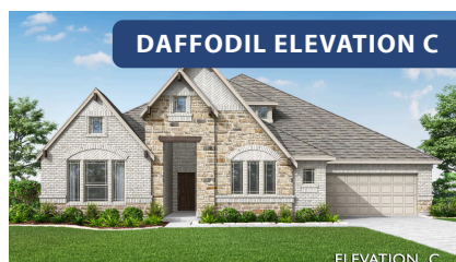
DAFFODIL ELEVATION C