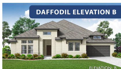
DAFFODIL ELEVATION B