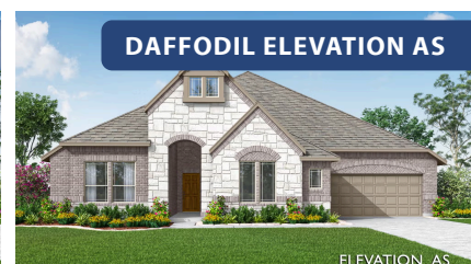
DAFFODIL ELEVATION AS